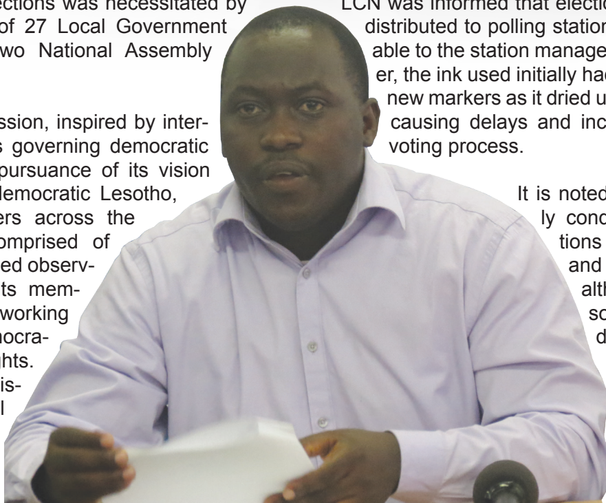
Democracy and Human Rights Commissioner Mr Thuso Ramabolu

LCN Observer Mission, inspired by international principles governing democratic elections and in pursuance of its vision of striving for a democratic Lesotho, deployed observers across the country. Team comprised of mobile and stationed observers drawn from its membership already working in the area of democracy and human rights. The Observers Mission covered all the ten districts of the country and about 80 percent of the polling stations, using the checklist, a