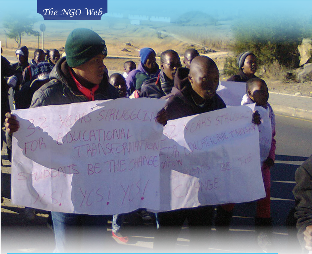
Young Christian Students march in Maseru

The new focus should be the manufacturing sector, which unfortunately is dreaded by most Basotho. This could be achieved by mobilising Basotho to invest in manufacturing activities that would at least generate employment locally. The government should also facilitate the search for international markets for lo-