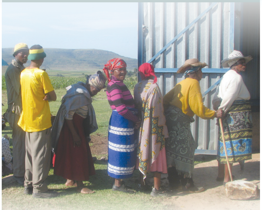
Voters queue outside a polling station at Qaqatu during the national by-elections held on February 15, 2014

capacity of an electoral management body in isolation will not necessarily produce credible elections, but the overall focus on the political environment in which the elections take place. It