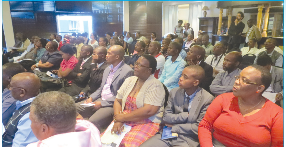
Civil Society representatives during the Post Budget Analysis event at Lehakoe Recreation Centre on February 20, 2014.

Further, it demonstrates the Government's intentions regarding