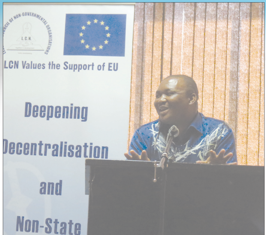
Deputy Prime Minister Mr Mothetjoa Metsing

note that the Government commits to review existing legislation and develop a comprehensive legal framework to provide guidance and enforcement in the implementation of decentralisation. It will further ensure that all actors have knowledge and un-